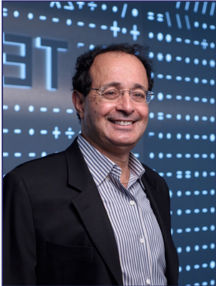
MIT Professor , Business & Supply Chain Analytics

Director, Data Science Lab, Massachusetts Institute of Technology, USA