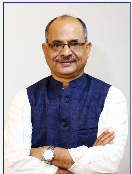
Director, IIM Mumbai

His work focuses on optimization, simulation, and computational intelligence for automating decision support in manufacturing and logistics systems.